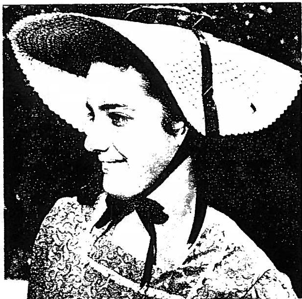
Your 18th Century Grandmother's Flat Hat